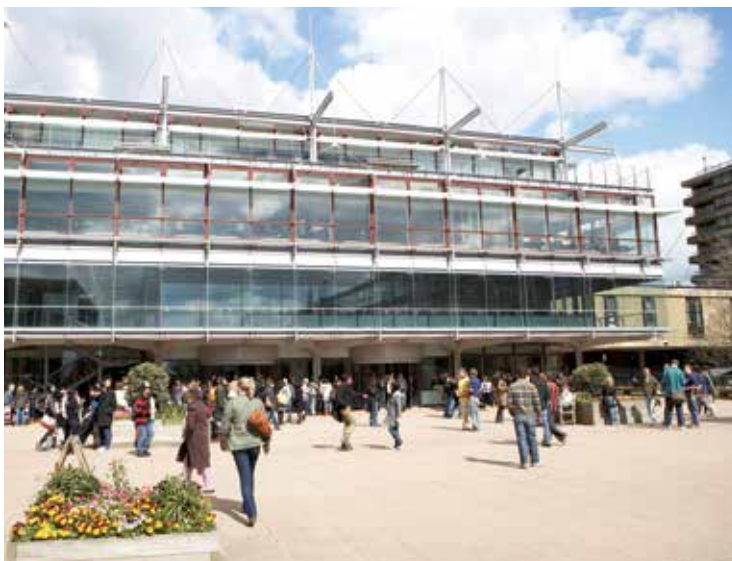
MBA facilities plan

We're located about a mile from Bath. Frequent bus services link the campus, city and major student residential areas, so you are always connected to your work, your home and your social life when studying.